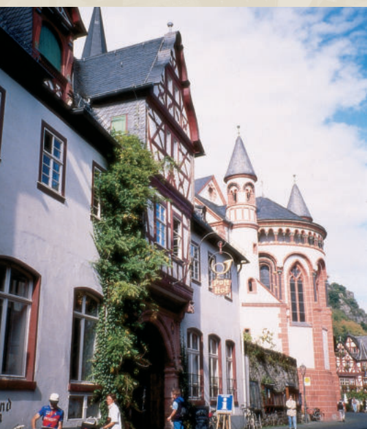
Posthof and The Church of St. Peter

At Bacharach on the Rhine, At Würzburg on the Stein, At Klingenberg on the Main, There, it is said, You will find the best of wine.